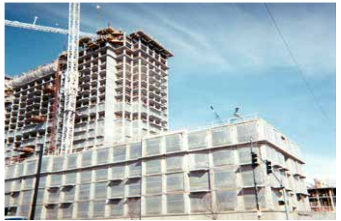
Building Abatement Enclosure

DURA♦SKRIM® 2FR and 10FR stock sizes are 12 and 20 feet wide by 100 feet long; they are also available in a variety of custom widths with minimum order quantities.