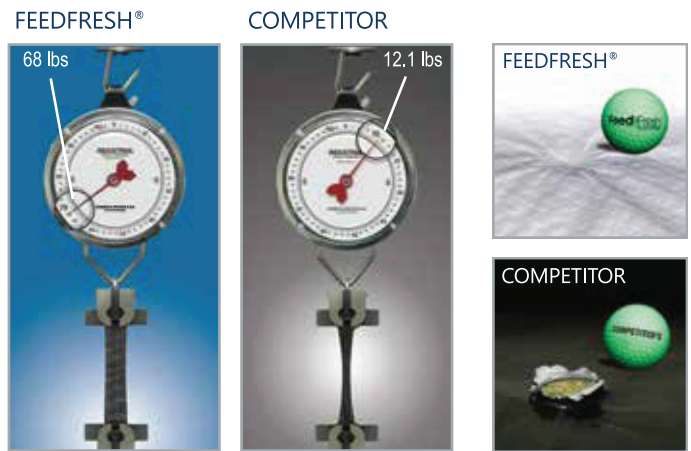
Scale Comparison: The amount of force required to pull cover materials near the breaking point. Golf Ball Comparison: FeedFresh® vs. competitive film using a golf ball to simulate direct impact force (similar to large hail), the competitor cover inverted to expose damage.