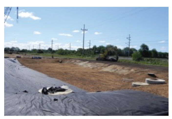
Installation of the secondary containment system